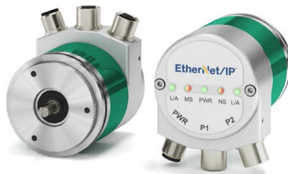
EM58 • HS58 • HM58 EP